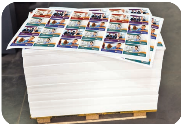
Impose and Print!