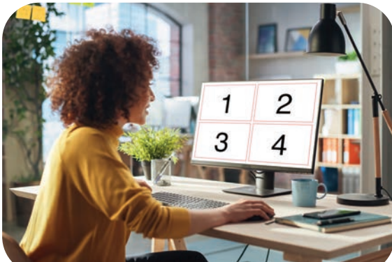
Design your imposition in Adobe InDesign

PDF Imposer does not require any additional apps (such as Adobe Acrobat) and functions completely within Adobe InDesign. If you are an Adobe InDesign user, we are certain that DesignMerge PDF Imposer will soon become your new, favorite imposition tool!